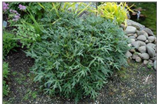
Dragon's Breath Rayflower