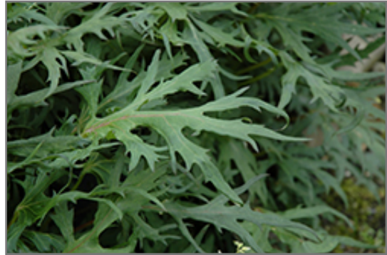
Dragon's Breath Rayflower foliage

Dragon's Breath Rayflower is recommended for the following landscape applications;