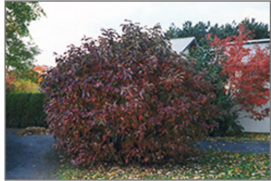
Siberian Dogwood in fall

This shrub does best in full sun to partial shade. It is an amazingly adaptable plant, tolerating both dry conditions and even some standing water. It is not particular as to soil type or pH. It is highly tolerant of urban pollution and will even thrive in inner city environments. This is a selected variety of a species not originally from North America.