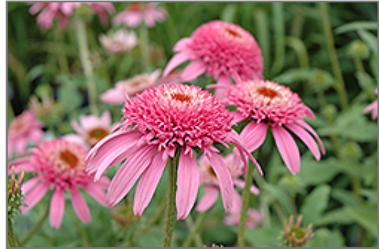
Cone-fections Pink Double Delight Coneflower flowers

Cone-fections Pink Double Delight Coneflower is recommended for the following landscape applications;