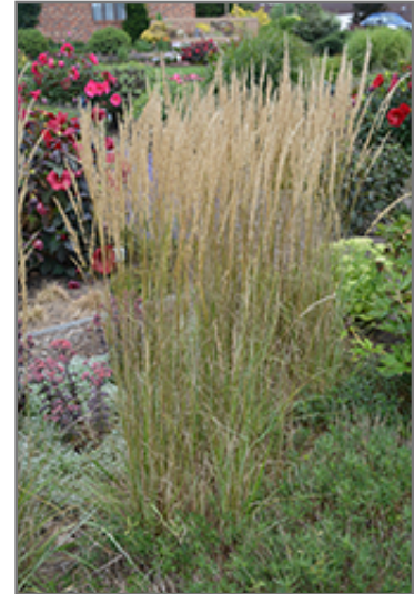
El Dorado Feather Reed Grass

El Dorado Feather Reed Grass is recommended for the following landscape applications;