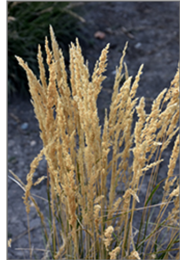
El Dorado Feather Reed Grass fruit

At Dutch Growers, we treat this plant as a "HOBBY PLANT". It is not officially recognized as winter-hardy in our zone 3, however, there is a strong likelihood that it will survive winter. Warranty expires on Nov. 1 season of purchase.