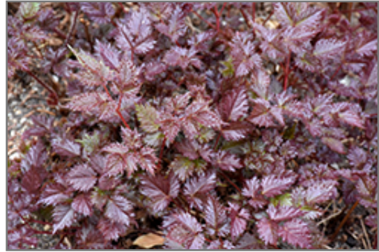
Delft Lace Astilbe foliage

Delft Lace Astilbe will grow to be about 16 inches tall at maturity extending to 24 inches tall with the flowers, with a spread of 12 inches. When grown in masses or used as a bedding plant, individual plants should be spaced approximately 12 inches apart. Its foliage tends to remain dense right to the ground, not requiring facer plants in front. It grows at a medium rate, and under ideal conditions can be expected to live for approximately 10 years. As an herbaceous perennial, this plant will usually die back to the crown each winter, and will regrow from the base each spring. Be careful not to disturb the crown in late winter when it may not be readily seen!