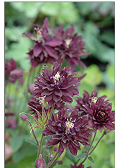
Clementine Dark Purple Columbine flowers