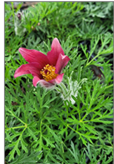
Red Pasqueflower flowers