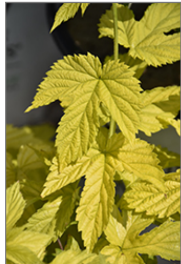
Golden Hops foliage