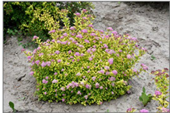
Sundrop Spirea in bloom