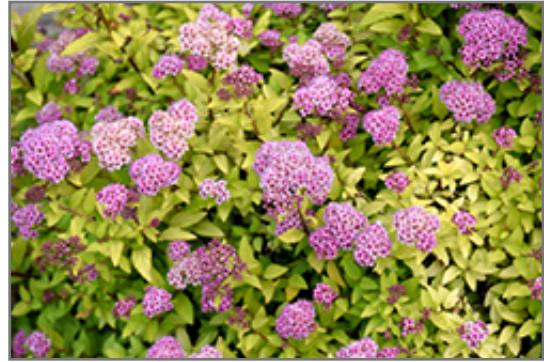
Sundrop Spirea flowers

Sundrop Spirea is recommended for the following landscape applications;