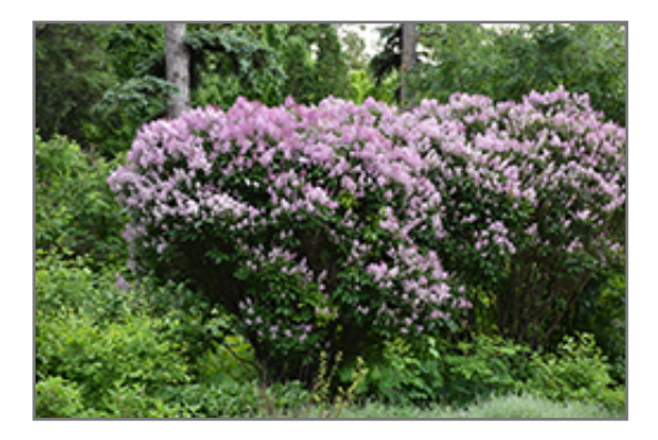
Donald Wyman Lilac in bloom