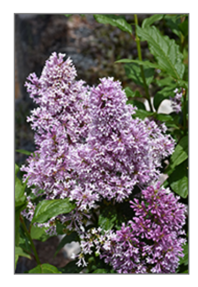
Donald Wyman Lilac flowers

Donald Wyman Lilac is recommended for the following landscape applications;