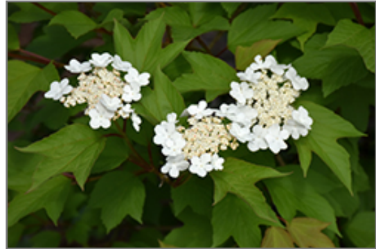
Redwing Highbush Cranberry flowers

Redwing Highbush Cranberry is a dense multi-stemmed deciduous shrub with an upright spreading habit of growth. Its average texture blends into the landscape, but can be balanced by one or two finer or coarser trees or shrubs for an effective composition.