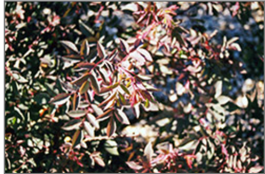
Red Leaf Rose foliage

This shrub should only be grown in full sunlight. It does best in average to evenly moist conditions, but will not tolerate standing water. It is not particular as to soil type or pH. It is highly tolerant of urban pollution and will even thrive in inner city environments. This species is not originally from North America.