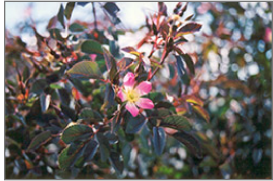
Red Leaf Rose flowers

This is a high maintenance shrub that will require regular care and upkeep, and is best pruned in late winter once the threat of extreme cold has passed. It is a good choice for attracting bees to your yard. Gardeners should be aware of the following characteristic(s) that may warrant special consideration;