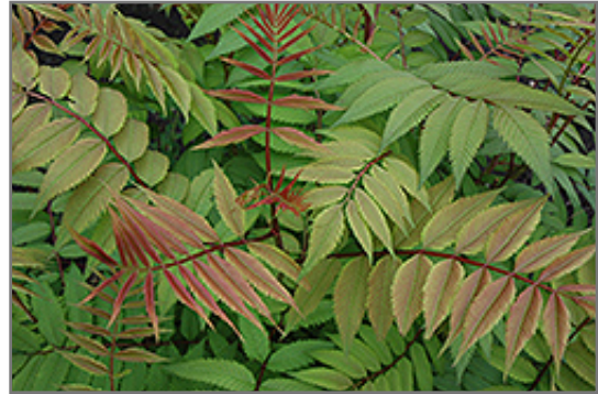
Sem False Spirea foliage