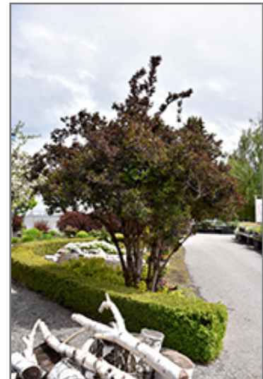
Black Beauty Elder