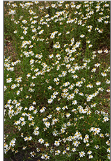
White Alpine Tickseed flowers