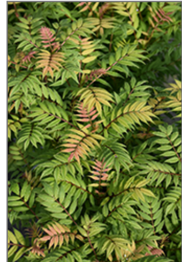
Mr. Mustard False Spirea foliage