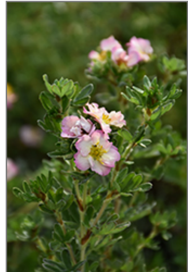
Happy Face Hearts Potentilla flowers