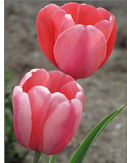
Pink Impression Tulip flowers