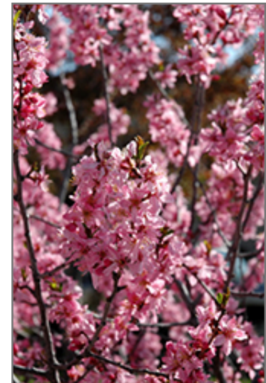
Muckle Plum (tree form) flowers