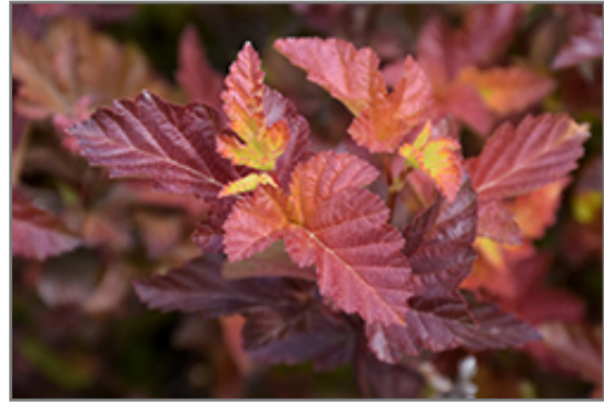
Center Glow Ninebark foliage

Center Glow Ninebark is recommended for the following landscape applications;