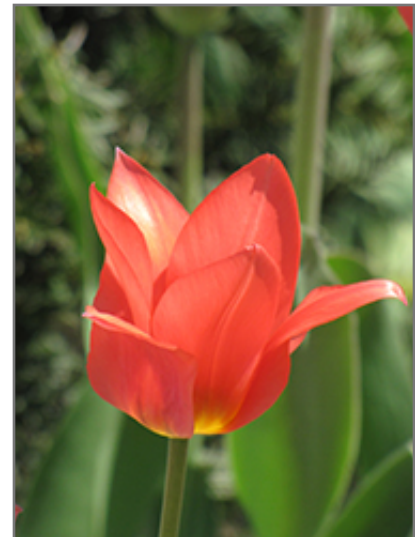
Red Emperor Tulip flowers