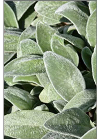
Lamb's Ears foliage

Lamb's Ears is recommended for the following landscape applications;