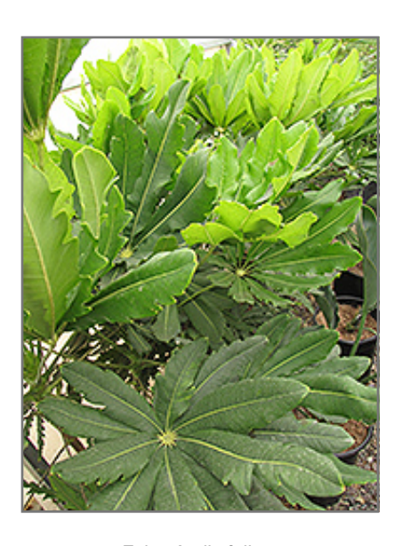
False Aralia foliage

When grown indoors, False Aralia can be expected to grow to be about 5 feet tall at maturity, with a spread of 24 inches. It grows at a medium rate, and under ideal conditions can be expected to live for approximately 10 years. This houseplant will do well in a location that gets either direct or indirect sunlight, although it will usually require a more brightly-lit environment than what artificial indoor lighting alone can provide. It prefers to grow in average to moist soil. The surface of the soil shouldn't be allowed to dry out completely, and so you should expect to water this plant once and possibly even twice each week. Be aware that your particular watering schedule may vary depending on its location in the room, the pot size, plant size and other conditions; if in doubt, ask one of our experts in the store for advice. It is not particular as to soil type or pH; an average potting soil should work just fine. Be warned that parts of this plant are known to be toxic to humans and animals, so special care should be exercised if growing it around children and pets.