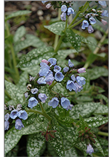
Roy Davidson Lungwort flowers