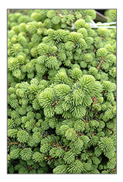
Little Gem Spruce foliage