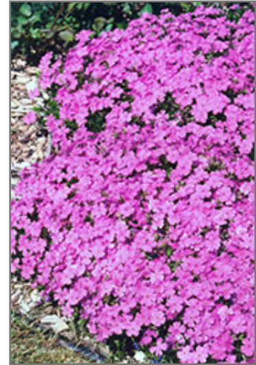
Arctic Phlox flowers