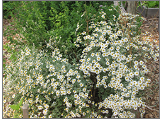
German Chamomile

This plant is quite ornamental as well as edible, and is as much at home in a landscape or flower garden as it is in a designated herb garden. It does best in full sun to partial shade. It is very adaptable to both dry and moist locations, and should do just fine under typical garden conditions. It is not particular as to soil type or pH. It is somewhat tolerant of urban pollution. This species is not originally from North America.