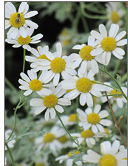
German Chamomile flowers