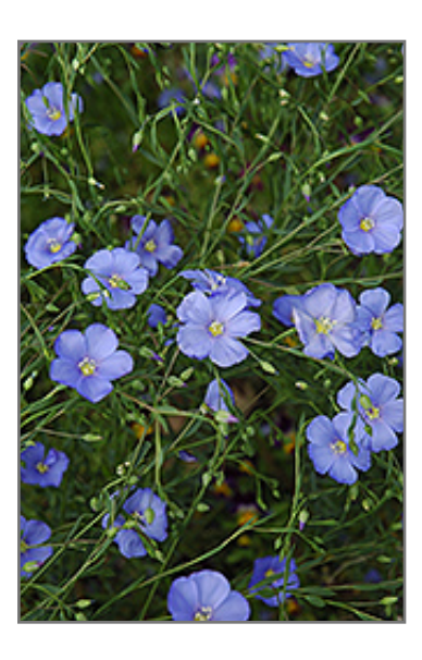
Perennial Flax flowers

Perennial Flax will grow to be about 24 inches tall at maturity, with a spread of 12 inches. When grown in masses or used as a bedding plant, individual plants should be spaced approximately 8 inches apart. It tends to be leggy, with a typical clearance of 1 foot from the ground, and should be underplanted with lower-growing perennials. It grows at a fast rate, and under ideal conditions can be expected to live for approximately 3 years. As an herbaceous perennial, this plant will usually die back to the crown each winter, and will regrow from the base each spring. Be careful not to disturb the crown in late winter when it may not be readily seen!