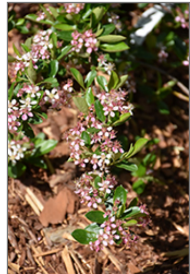
Ground Hug Aronia flowers