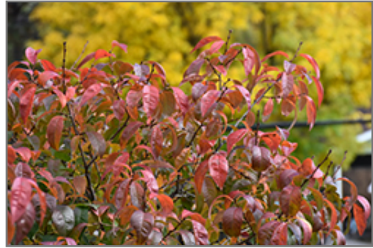
Muckle Plum in fall

This shrub should only be grown in full sunlight. It does best in average to evenly moist conditions, but will not tolerate standing water. It is not particular as to soil type or pH. It is highly tolerant of urban pollution and will even thrive in inner city environments. This particular variety is an interspecific hybrid.