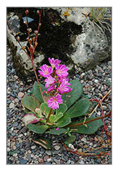
Bitterroot in bloom