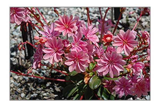
Bitterroot flowers