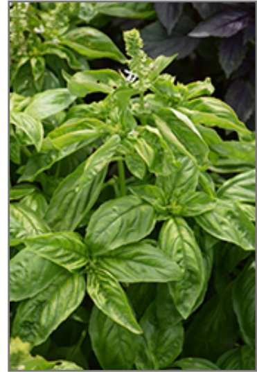
Genovese Basil foliage

Genovese Basil will grow to be about 20 inches tall at maturity, with a spread of 14 inches. When grown in masses or used as a bedding plant, individual plants should be spaced approximately 12 inches apart. This fast-growing annual will normally live for one full growing season, needing replacement the following year.