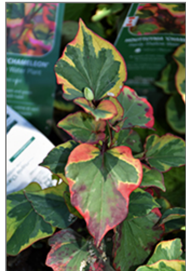
Variegated Chameleon Plant foliage