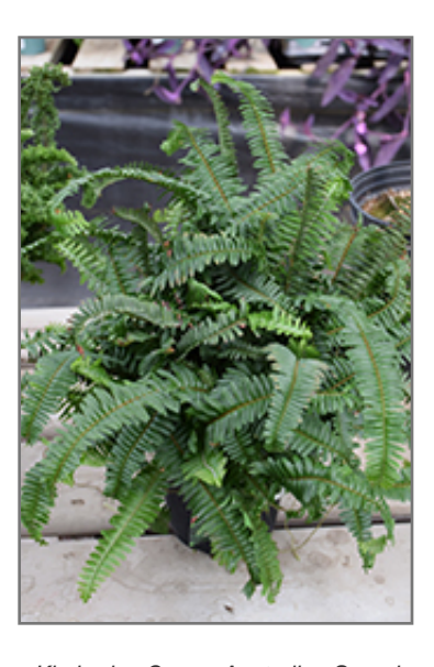
Kimberley Queen Australian Sword Fern in full

When grown indoors, Kimberley Queen Australian Sword Fern can be expected to grow to be about 3 feet tall at maturity, with a spread of 3 feet. It grows at a fast rate, and under ideal conditions can be expected to live for approximately 20 years. This houseplant performs well in both bright or indirect sunlight and strong artificial light, and can therefore be situated in almost any well-lit room or location. It does best in average to evenly moist soil, but will not tolerate standing water. The surface of the soil shouldn't be allowed to dry out completely, and so you should expect to water this plant once and possibly even twice each week. Be aware that your particular watering schedule may vary depending on its location in the room, the pot size, plant size and other conditions; if in doubt, ask one of our experts in the store for advice. It is not particular as to soil pH, but grows best in rich soil. Contact the store for specific recommendations on pre-mixed potting soil for this plant.