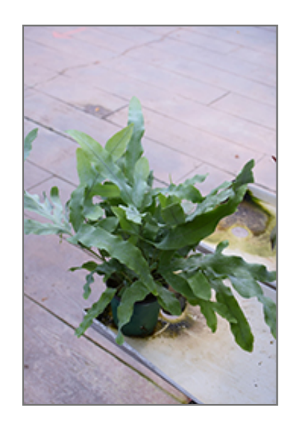
Blue Star Fern in full