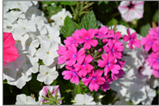
Superbena Pink Shades Verbena flowers

Superbena Pink Shades Verbena is recommended for the following landscape applications;