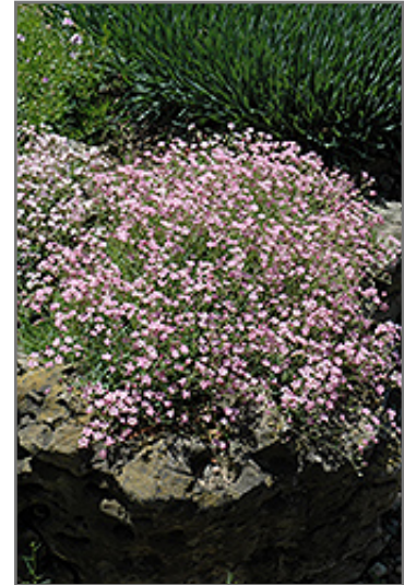
Pink Creeping Baby's Breath in bloom