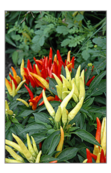
Chilly Chili Ornamental Pepper fruit

When grown indoors, Chilly Chili Ornamental Pepper can be expected to grow to be about 16 inches tall at maturity, with a spread of 18 inches. It grows at a medium rate, and under ideal conditions can be expected to live for approximately 1 years. This houseplant requires direct sun for optimal performance, and should therefore be situated in a room that gets bright sunlight for a good part of the day; it is not a good choice for rooms lit only by artificial light. It is very adaptable to both dry and moist soil, but will not tolerate any standing water. The surface of the soil shouldn't be allowed to dry out completely, and so you should expect to water this plant once and possibly even twice each week. Be aware that your particular watering schedule may vary depending on its location in the room, the pot size, plant size and other conditions; if in doubt, ask one of our experts in the store for advice. It is not particular as to soil type or pH; an average potting soil should work just fine.