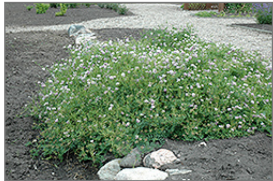
Crown Vetch in bloom