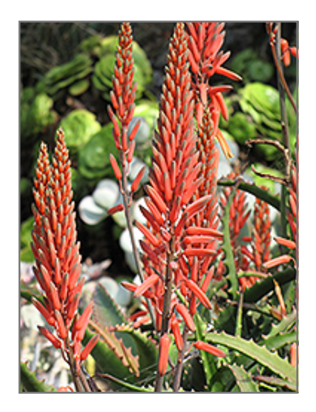
Aloe Vera flowers

When grown indoors, Aloe Vera can be expected to grow to be about 24 inches tall at maturity extending to 3 feet tall with the flowers, with a spread of 24 inches. It grows at a slow rate, and under ideal conditions can be expected to live for approximately 40 years. This houseplant requires direct sun for optimal performance, and should therefore be situated in a room that gets bright sunlight for a good part of the day; it is not a good choice for rooms lit only by artificial light. It prefers dry to average moisture levels with very well-drained soil, and may die if left in standing water for any length of time. This plant should be watered when the surface of the soil gets dry, and will need watering approximately once each week. Be aware that your particular watering schedule may vary depending on its location in the room, the pot size, plant size and other conditions; if in doubt, ask one of our experts in the store for advice. It is not particular as to soil pH, but grows best in sandy soil. Contact the store for specific recommendations on pre-mixed potting soil for this plant.