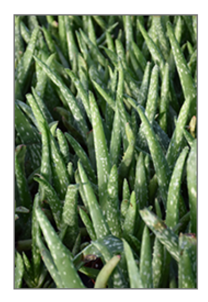
Aloe Vera

This is an herbaceous evergreen houseplant with an upright spreading habit of growth. Its wonderfully bold, coarse texture is quite ornamental and should be used to full effect. This plant usually looks its best without pruning, although it will tolerate pruning.