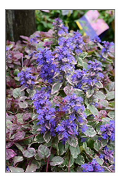
Burgundy Glow Bugleweed flowers

Burgundy Glow Bugleweed is a dense herbaceous evergreen perennial with a ground-hugging habit of growth. Its medium texture blends into the garden, but can always be balanced by a couple of finer or coarser plants for an effective composition.