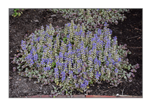
Burgundy Glow Bugleweed in bloom

At Dutch Growers, we treat this plant as a "HOBBY PLANT". It is not officially recognized as winter-hardy in our zone 3, however, there is a strong liklihood that it will survive winter. Warranty expires on Nov. 1 season of purchase.