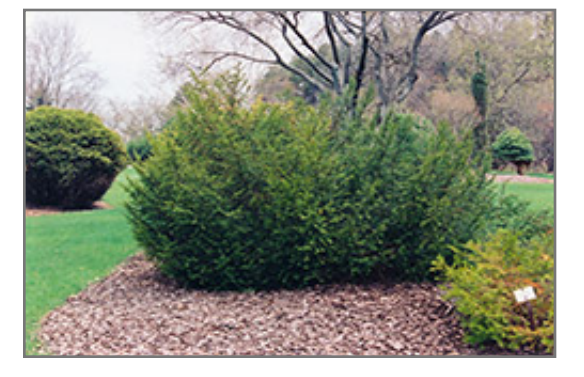
Canadian Yew

An uncommon native evergreen shrub with a bushy and sprawling habit of growth, dark green foliage tends to turn reddish-brown in winter; very hardy but requires winter shade and reliable snow cover, makes a good large groundcover for shady parts