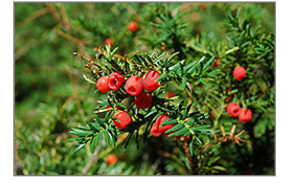
Canadian Yew fruit