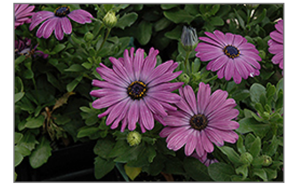
Zion Blue Denim African Daisy flowers