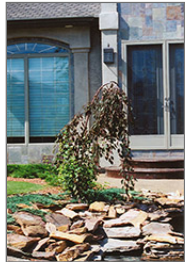
Royal Beauty Flowering Crab