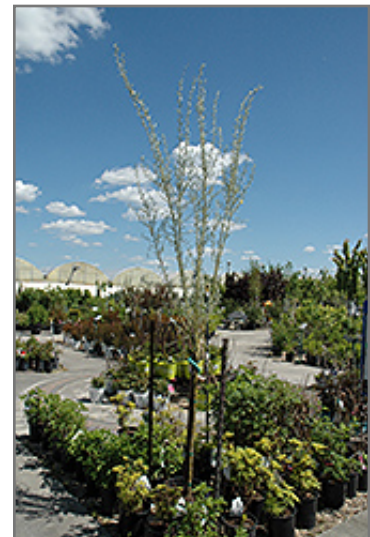
Mongolian Silver Spires Littleleaf Peashrub