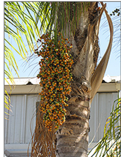
Queen Palm fruit