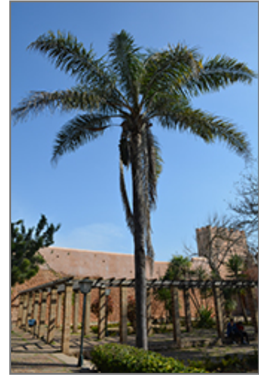
Queen Palm

Queen Palm is recommended for the following landscape applications;