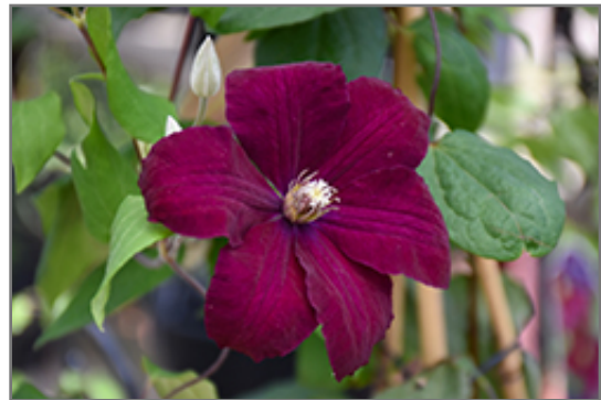
Rouge Cardinal Clematis flowers