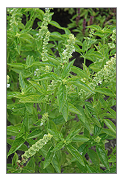
Sweet Italian Basil flowers