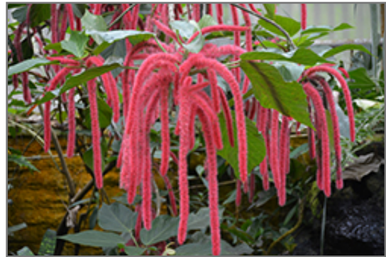
Firetail Chenille Plant flowers