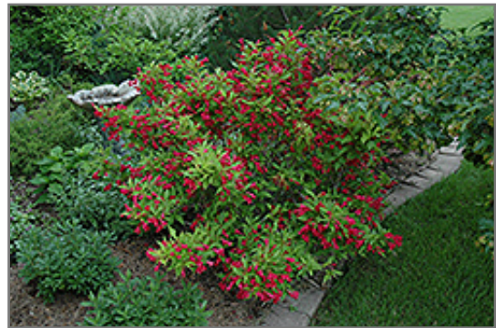
Red Prince Weigela in bloom